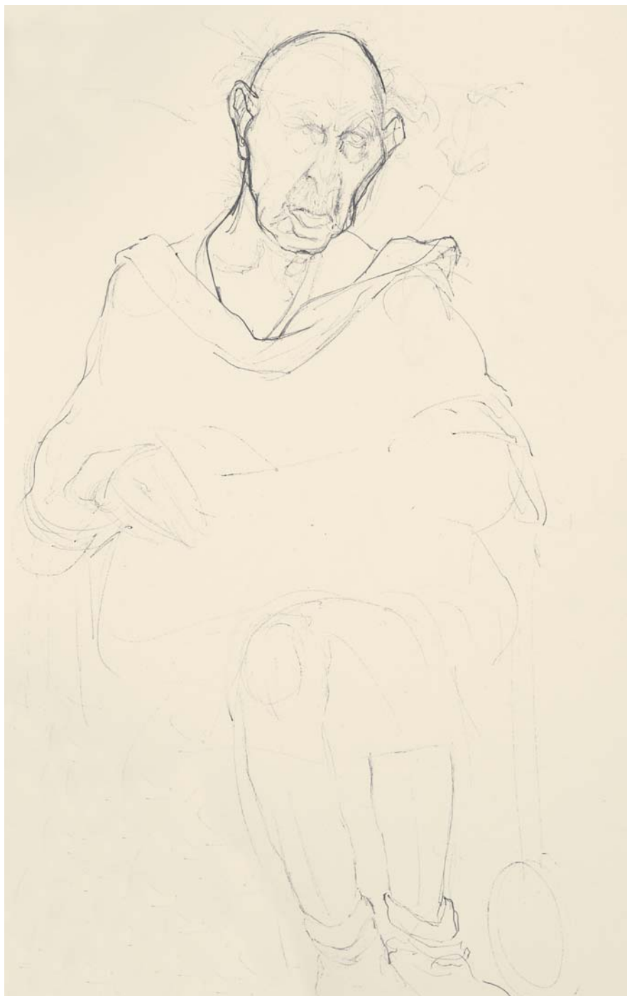
THIS PORTRAIT OF TURNER'S FRIEND JOE WAS THE IMPETUS FOR HIS PORTRAIT SERIES.

"There are 40 different colors and five different values of each," says Turner. "So, 200 panels. It's like when you go to a paint store and you go from gray through the primaries, even the secondaries, and I am after five values in each color so it is that sort of color study. And, they are